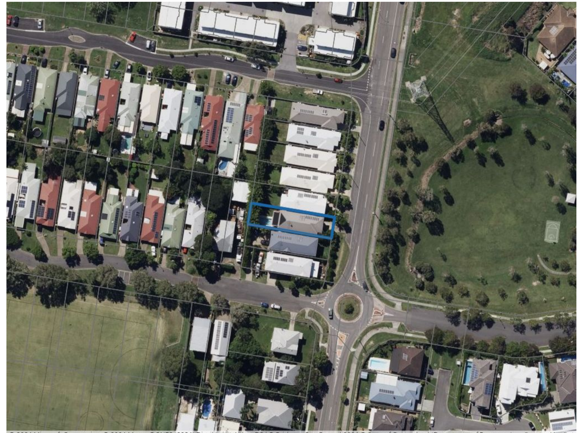
174 Barrack Rd, Cannon Hill QLD 4170

Regional Plan: South East Queensland Regional Plan 2017 Land Use Designation: Urban Footprint Planning Scheme: Brisbane City Plan 2014 (Version 28) Zone: Low Density Residential Zone Precinct: N/A Local Plan: River Gateway Local Plan Precinct: N/A Local Plan Sub-Precinct: N/A