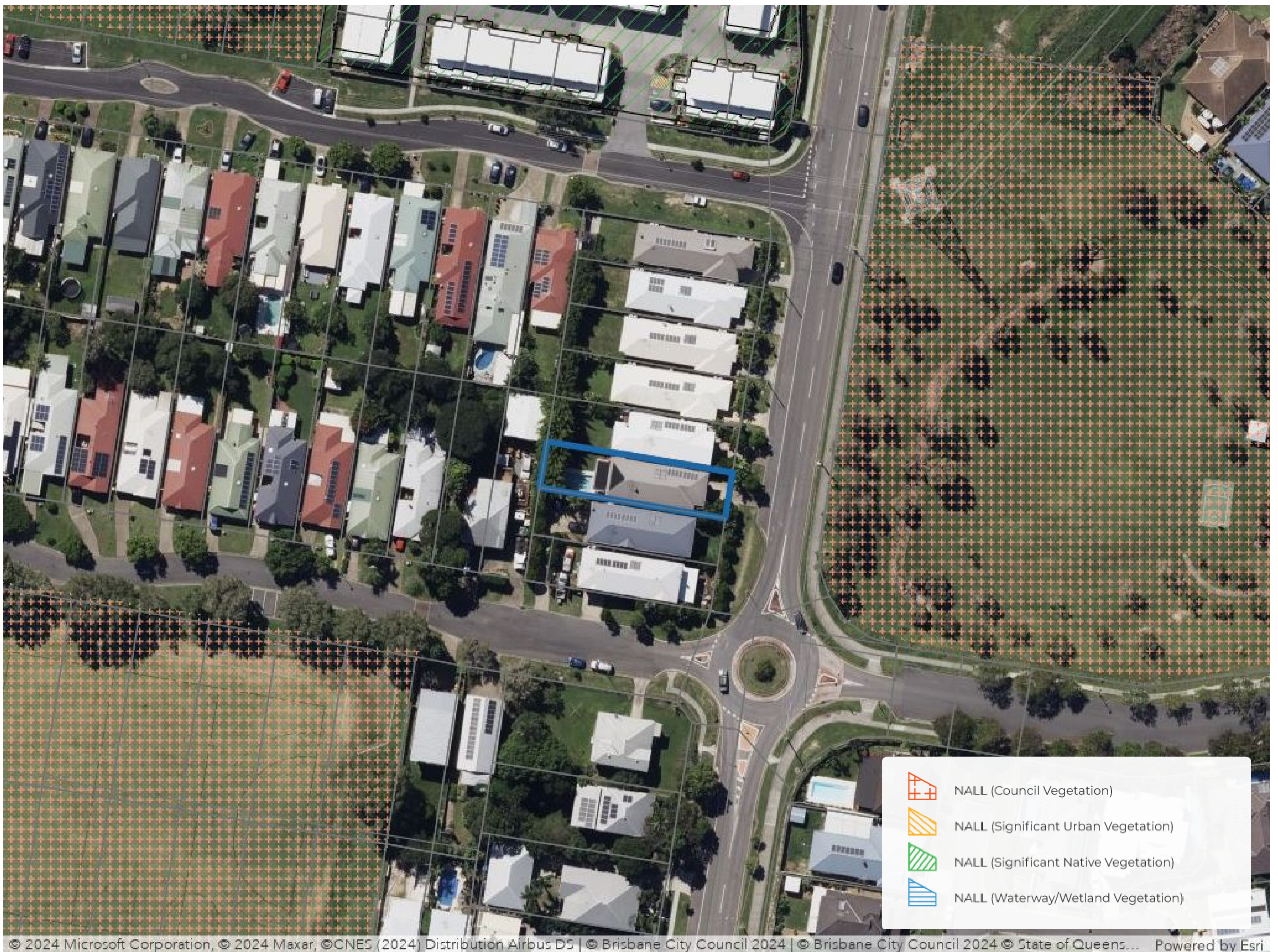
© 2024 Microsoft Corporation, © 2024 Maxar, ©CNE5 (2024) Distribution Airbus D5 | © Brisbane City Council 2024 | © Brisbane City Council 2024 © State of Queens... Powered by Esri

NO Biodiversity has not been identified on the property.