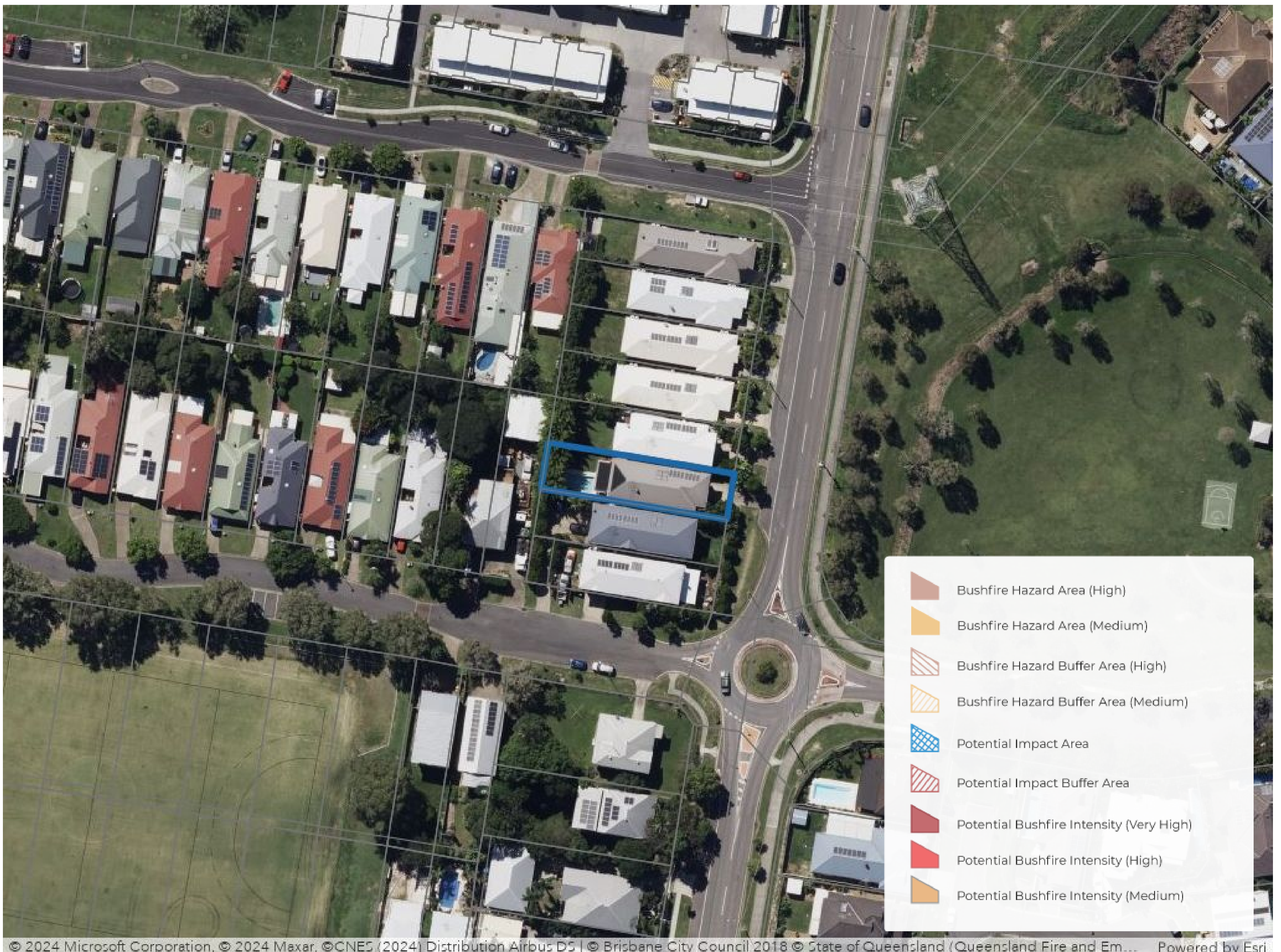
© 2024 Microsoft Corporation, © 2024 Maxar, ©CNE5 (2024) Distribution Airbus D5 | © Brisbane City Council 2018 © State of Queensland (Queensland Fire and Em... Powered by Esri

NO The property is not subject to the risk of potential bushfire.