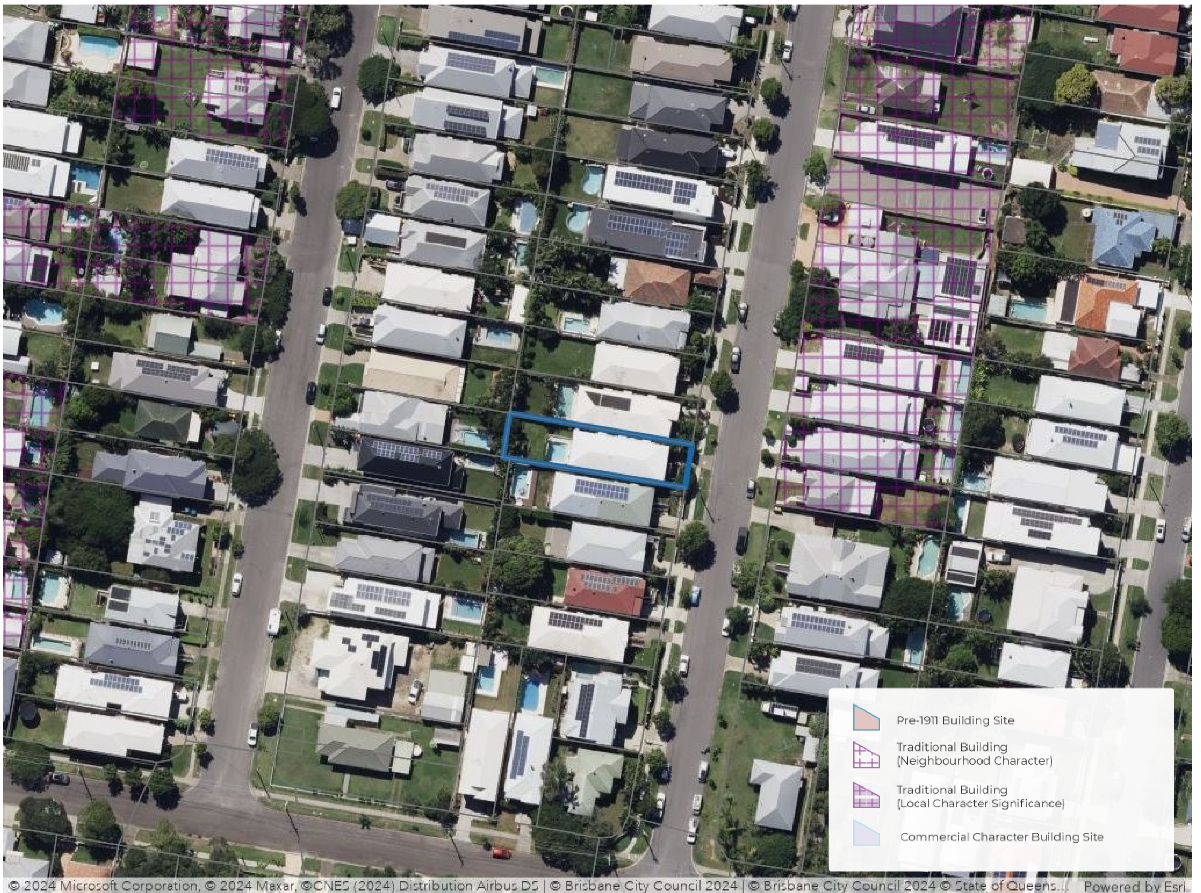
© 2024 Microsoft Corporation, © 2024 Maxar, ©CNE5 (2024) Distribution Airbus DS | © Brisbane City Council 2024 | © Brisbane City Council 2024 © State of Queens... Powered by Esri

NO Character protections have not been identified on the property.