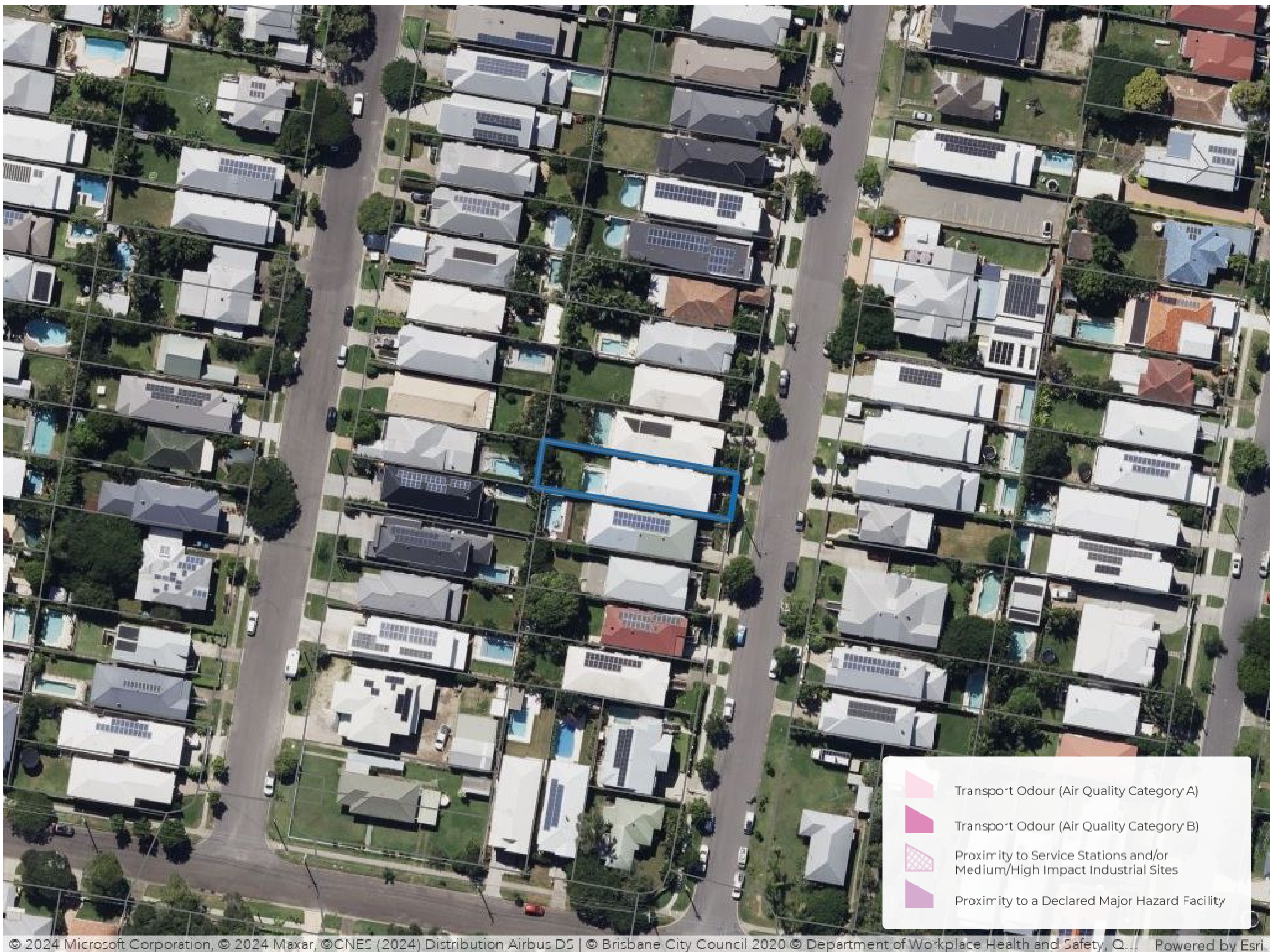
© 2024 Microsoft Corporation, © 2024 Maxar, ©CNE5 (2024) Distribution Airbus DS | © Brisbane City Council 2020 © Department of Workplace Health and Safety, Q... Powered by Esri

NO Odour Impacts have not been identified on the property.