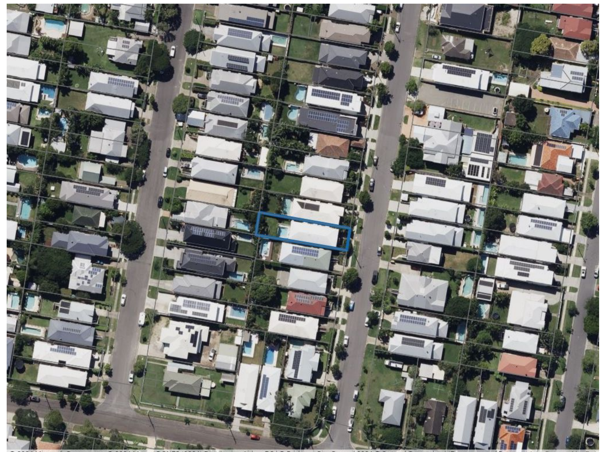
59 Keats St, Cannon Hill QLD 4170

Regional Plan: South East Queensland Regional Plan 2017 Land Use Designation: Urban Footprint Planning Scheme: Brisbane City Plan 2014 (Version 28) Zone: Low Density Residential Zone Precinct: N/A Local Plan: River Gateway Local Plan Precinct: N/A Local Plan Sub-Precinct: N/A