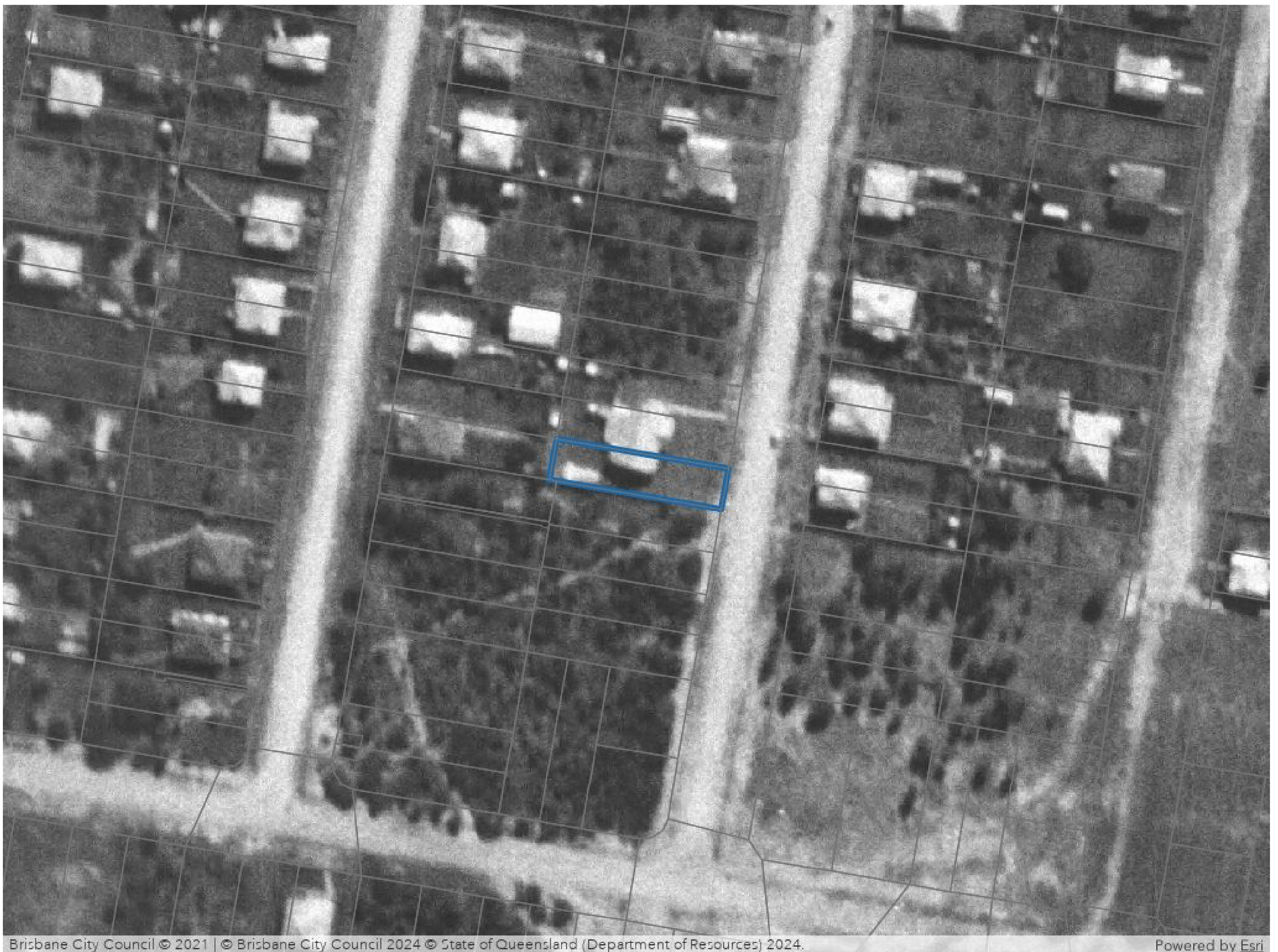
Brisbane City Council © 2021 | © Brisbane City Council 2024 © State of Queensland (Department of Resources) 2024.