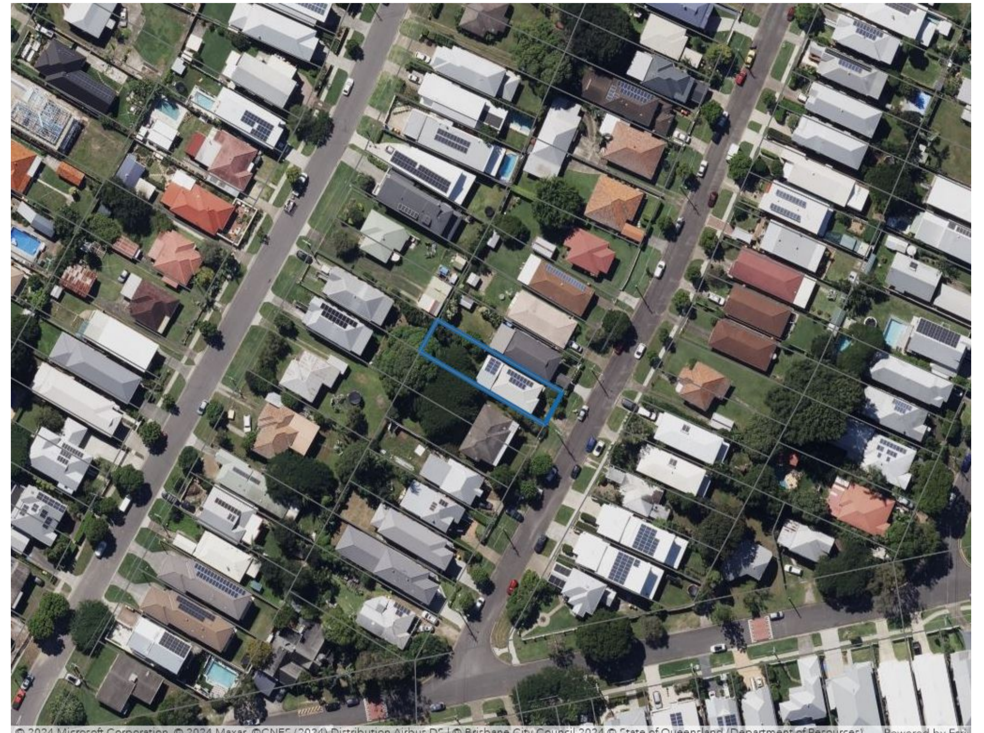
16 Gatling Rd, Cannon Hill QLD 4170

Regional Plan: South East Queensland Regional Plan 2017 Land Use Designation: Urban Footprint Planning Scheme: Brisbane City Plan 2014 (Version 28) Zone: Low Density Residential Zone Precinct: N/A Local Plan: River Gateway Local Plan Precinct: N/A Local Plan Sub-Precinct: N/A