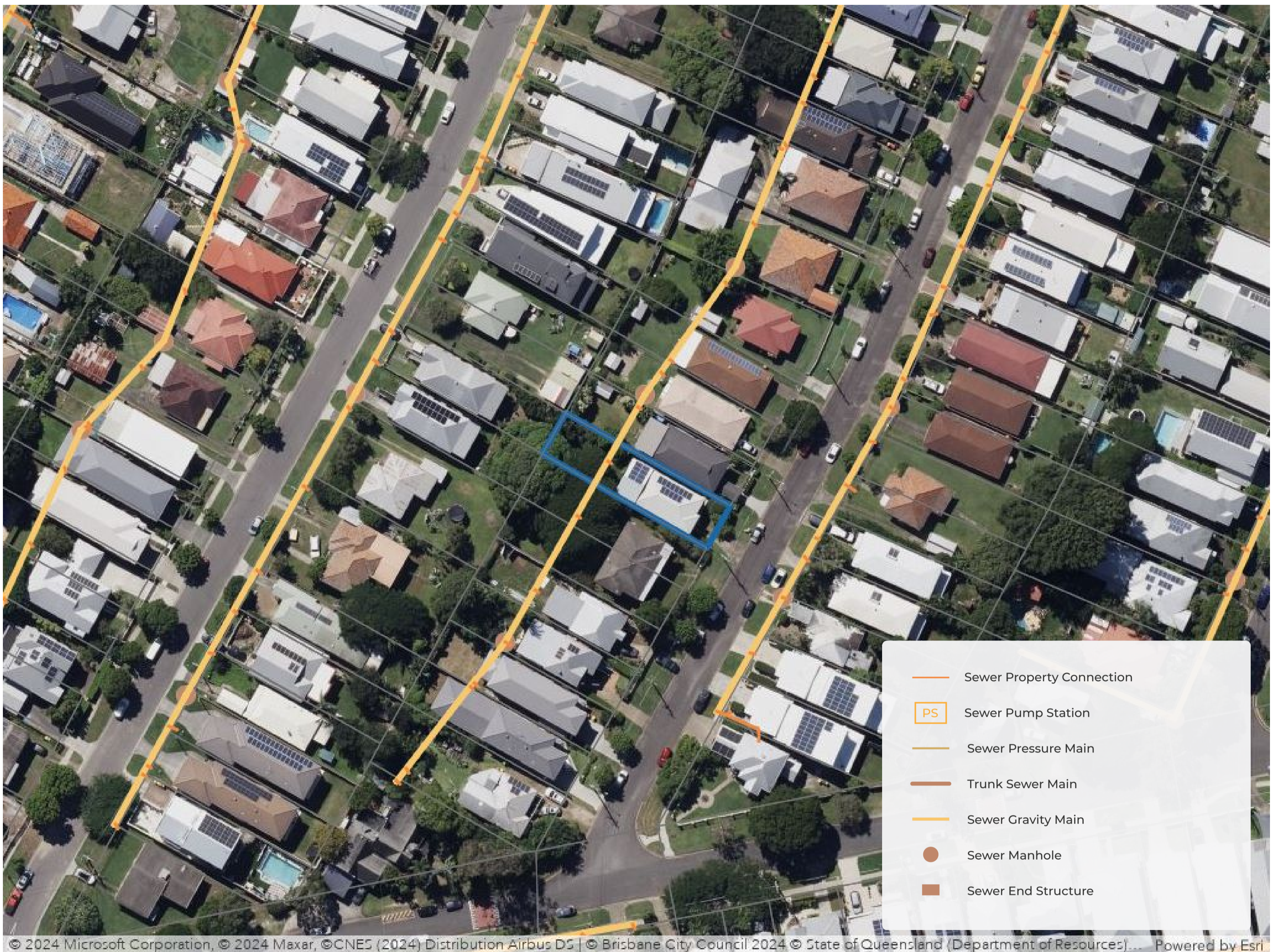
© 2024 Microsoft Corporation, © 2024 Maxar, ©CNE5 (2024) Distribution Airbus DS | © Brisbane City Council 2024 © State of Queensland (Department of Resources)... Powered by Esri

YES Sewer Infrastructure has been identified on the property.